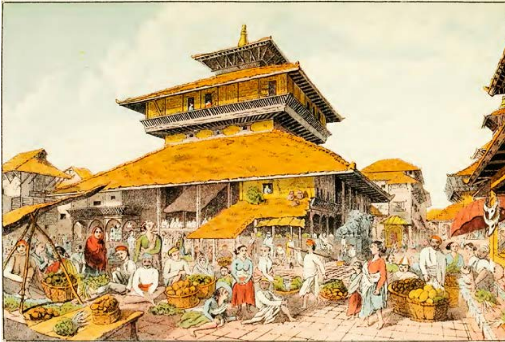
Fig. 1: "The Market Place, Kathmandu," 1860s watercolor by H. A. Oldfield.

Kasthamandap occupies a central location in Kathmandu valley, at the intersection of two ancient towns known as Koligrama and Daksina (south) Koligrama (and later as Yambu and Yangal).[4] Moreover, Kasthamandap sits squarely at the crossroads of the ancient trade route that connected India with Tibet and the principal North-South road of Kathmandu. Within a few yards of Kasthamandap, and also flanking the ancient crossroads sit two other sattals , Laksmi Narayana Sattal (17th c) and Silyan (Singha) Sattal (16th c, although legend claims this one is as old as the original Kasthamandap).[5] Together, the three sattals at the heart of the valley must have catered to the traffic at the crossroads, much like motels that are found at the junction of major modern highways in the US.