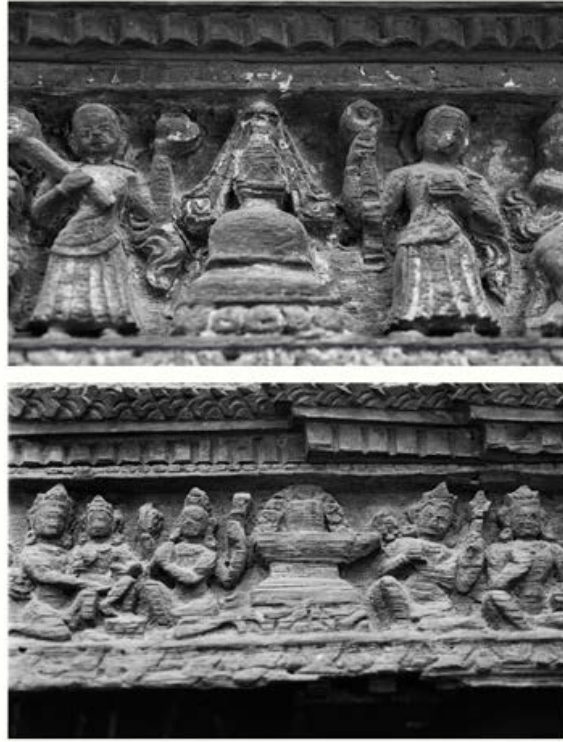
Fig. 6: Frieze details from Kasthamandap: a group of monks worshipping the Buddhist stupa (above) and another group of devotees worshipping the Shiva Linga (below).