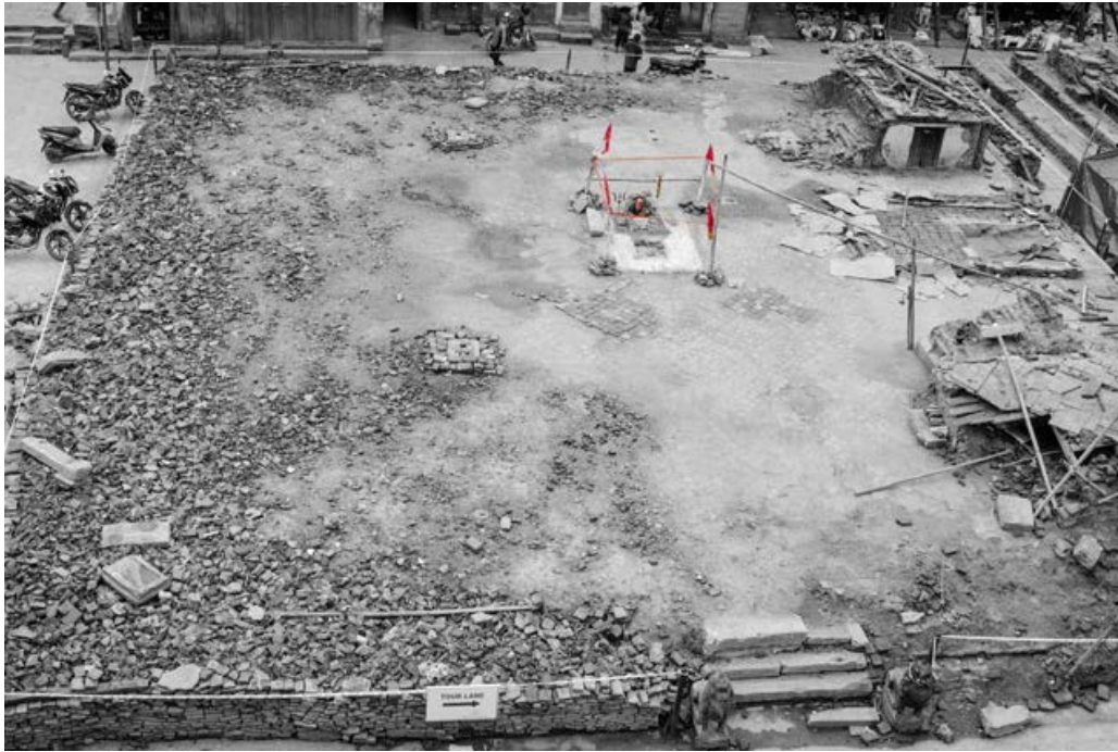
Fig. 3: Kasthamandap ruin showing a makeshift mandap.

Let us, then, recollect the established historic evidence of Kasthamandap, a building of such importance it has been recognized as “the singlemost ( sic ) important building of Kathmandu.”[7] Let us also act immediately to seek out what remains, and to restore the sattal to its rightful place at the heart of old Kathmandu.