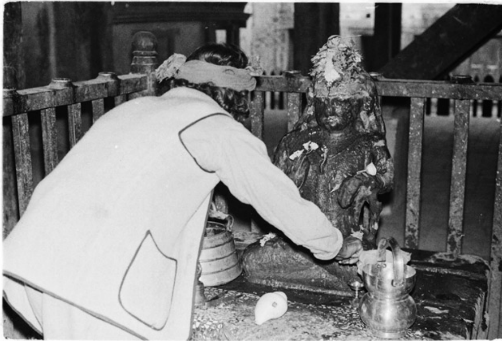
Fig. 7: Nath yogi performs puja (worship) of the Gorakshyanath statue.

Gorakshyanath is believed to have traveled to Kathmandu himself. We can assume that his arrival was warmly received by rulers and valley dwellers who always had a soft spot for Shiva, who in the guise of Lord Pashupatinath was one of the principal patron gods of their enchanted valley. On a side note, a small and then-insignificant hill state to the west of the Kathmandu valley, known as Gorkha, had also incorporated Gorakshyanath as their patron saint.