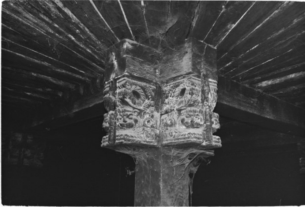
Fig. 4: Capital of one of the four central ground-floor pillars. Photo Mary Slusser 1970