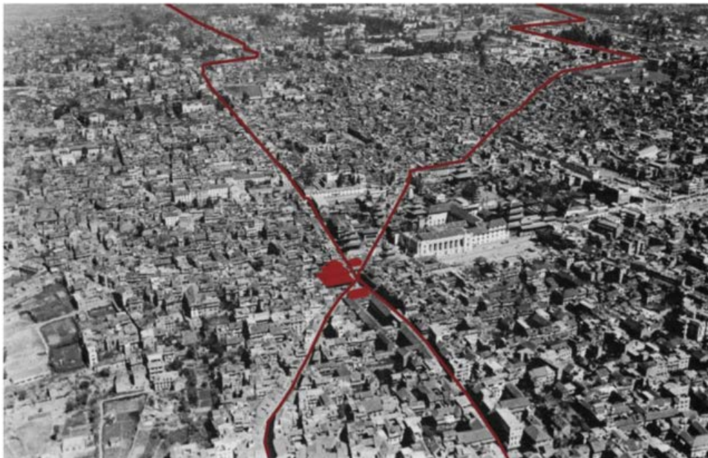
Fig. 2 : The ancient trans-Himalayan trade route crossed the main Kathmandu North-South road at Kasthamandap.

Kasthamandap occupies a central location in Kathmandu valley, at the intersection of two ancient towns known as Koligrama and Daksina (south) Koligrama (and later as Yambu and Yangal).[4] Moreover, Kasthamandap sits squarely at the crossroads of the ancient trade route that connected India with Tibet and the principal North-South road of Kathmandu. Within a few yards of Kasthamandap, and also flanking the ancient crossroads sit two other sattals , Laksmi Narayana Sattal (17th c) and Silyan (Singha) Sattal (16th c, although legend claims this one is as old as the original Kasthamandap).[5] Together, the three sattals at the heart of the valley must have catered to the traffic at the crossroads, much like motels that are found at the junction of major modern highways in the US.